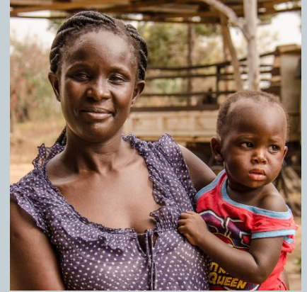
An NHU missionary caring for a needy child.