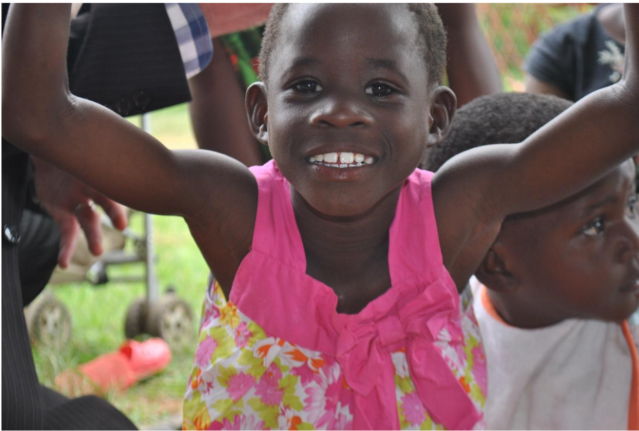
Sponsor a child like this sweet baby girl.

Option One: Sponsor a Child. We need 263 sponsors to meet all child sponsorship and program needs. You can fully sponsor a child for $70 or co-sponsor for $35.