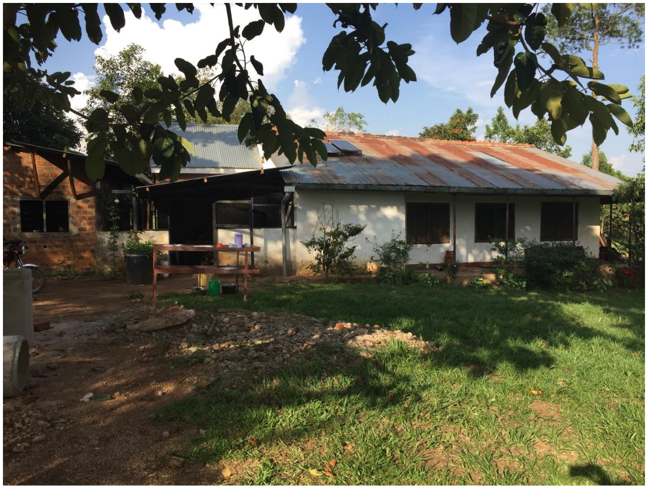
One of our aging buildings.

> Kasana is where NHU started. Most of the structures have aged and thus we're declaring 2017 the year of infrastructure remodel and upkeep. We're going for campus excellence.