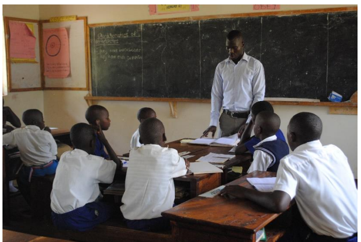
Some of our students during a science lesson at Kasana.