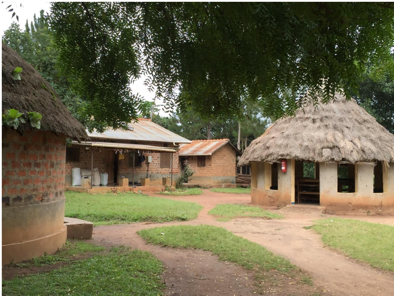
Buildings like these are in need of repair.

We need an additional $2,000 per month. This helps us meet our everyday operating expenses that are often not exciting but are necessary for us to stay open and ministering to people. This helps cover groundskeepers, security, public building repairs, water supply, and electricity. Any monthly amount would greatly help care for our infrastructure.