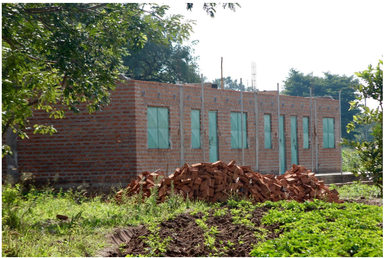
Our partly finished school at Kobwin Children's Center.

> Musana camp is almost all new construction. This means these is a greater need for general operating costs. Furthermore, the staff is expanding to allow for more guests.