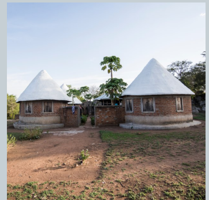
Round hut structures.