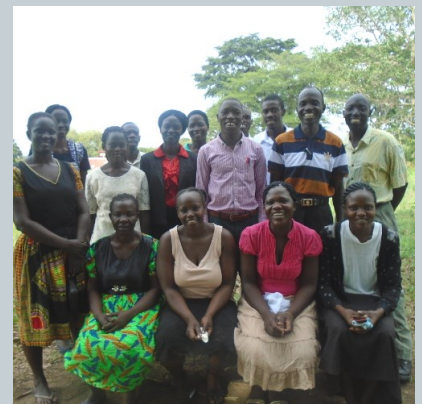
2018 Kobwin Staff

Bringing the Fatherhood of God to the fatherless.