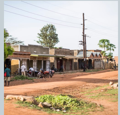
Nearby Kobwin village.

Our ability to care for the fatherless in our community hinges on our ability to provide quality care, administrative leadership, and a professionally operated children's center. In order to achieve those goals, we must be able to provide value to our staff with housing that is acceptable in our remote area. By caring for our Ugandan missionaries, we create unity and an environment where each individual is freed from burdens that might hold them back from their potential and ability to serve God with their respective giftings.