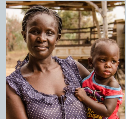
Kobwin Clinic nurse.