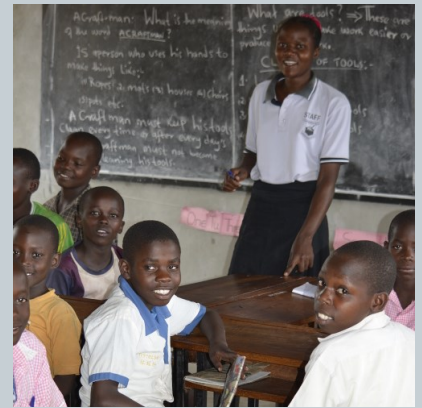
Teacher at Kobwin Primary School.