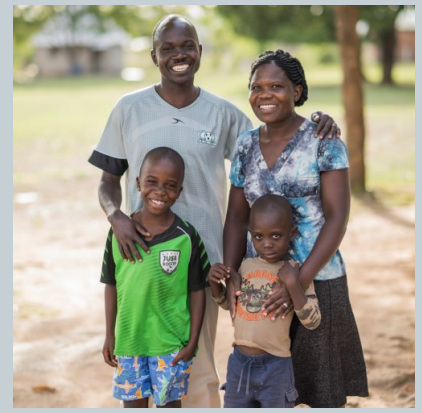
Ugandan missionary family.

www.newhopeuganda.org/get-involved/needs